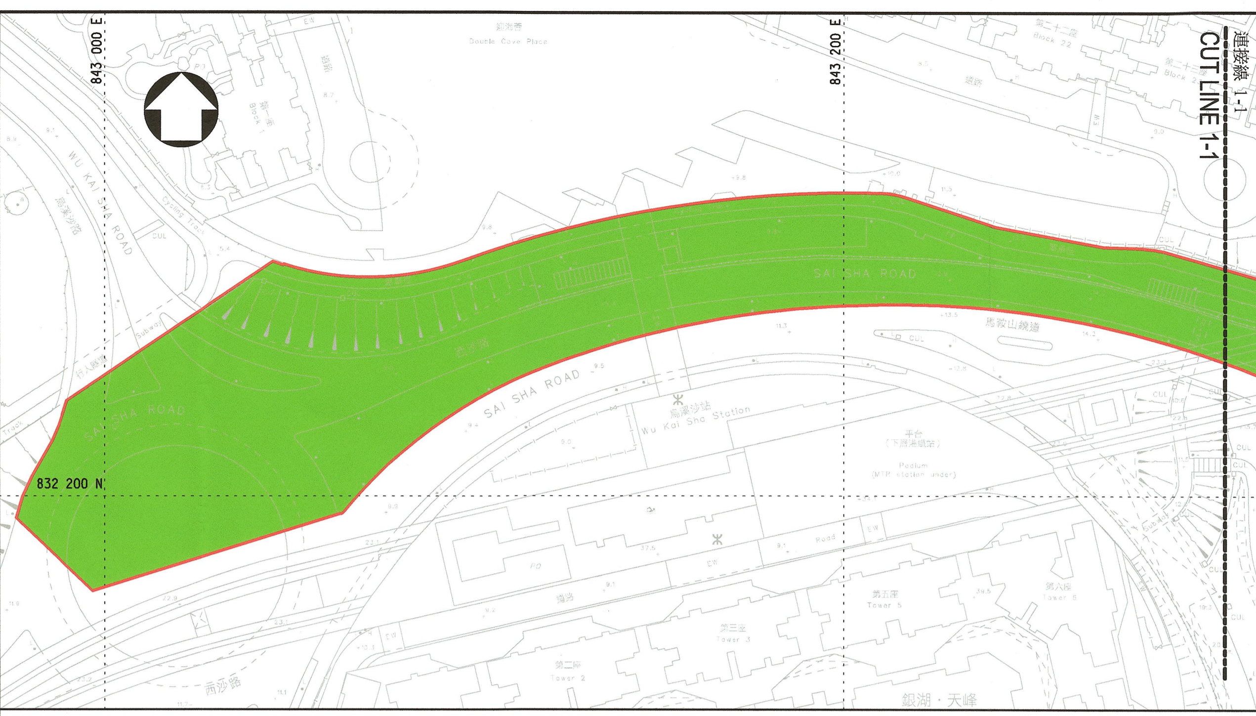
插圖A INSET A 比例 SCALE 1:1000