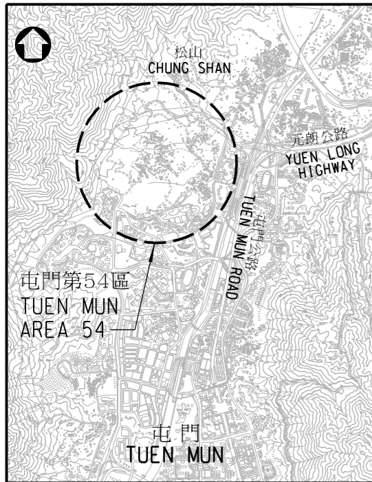
位置圖 LOCATION PLAN