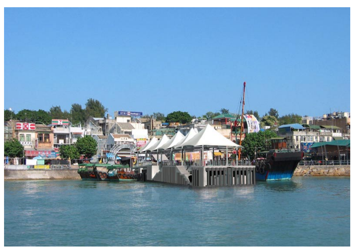
Plate 14 – Cheung Chau Public Pier