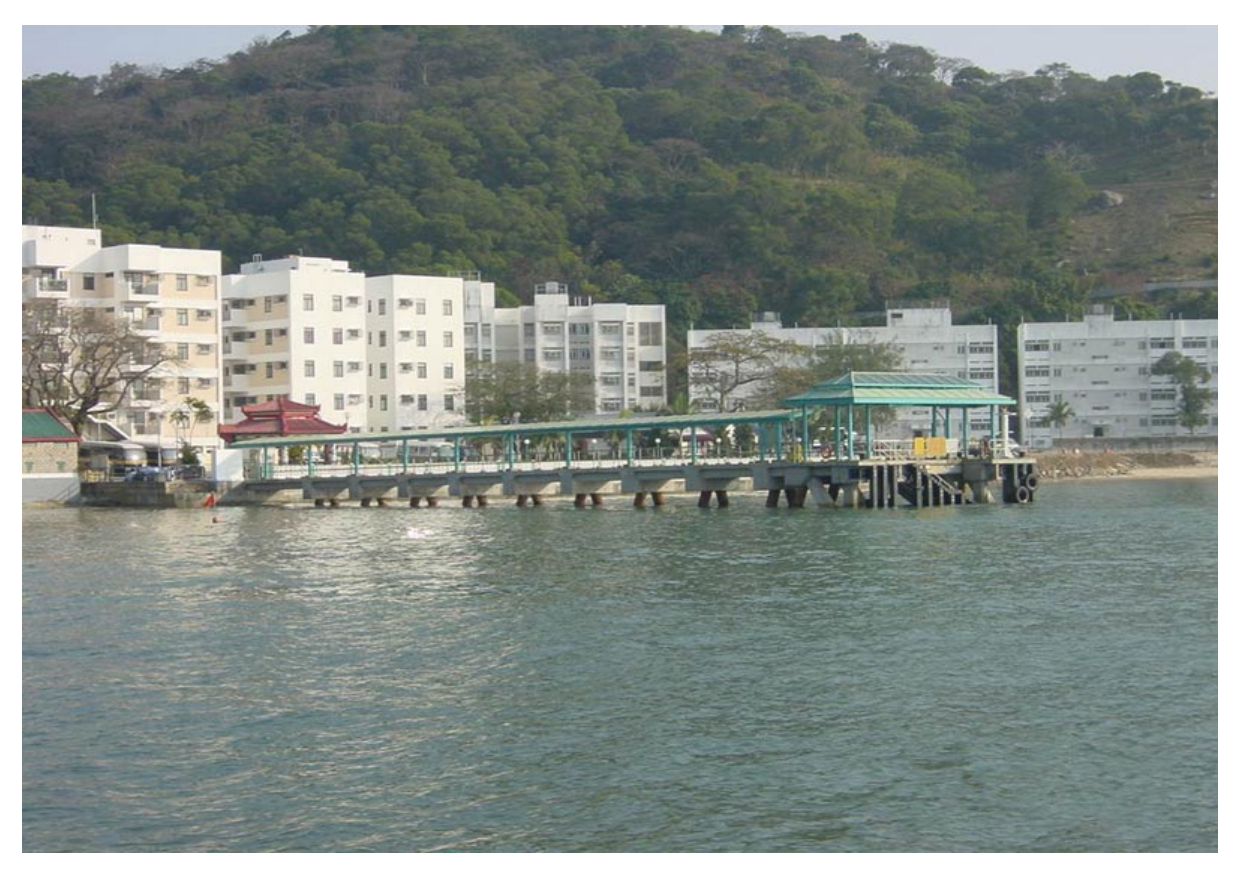
Plate 12 – Hei Ling Chau Pier