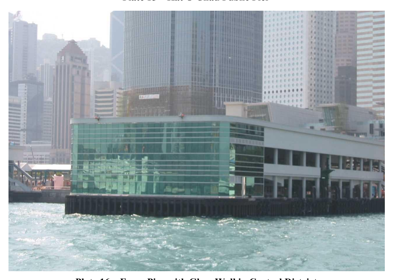
Plate 16 – Ferry Pier with Glass Wall in Central District