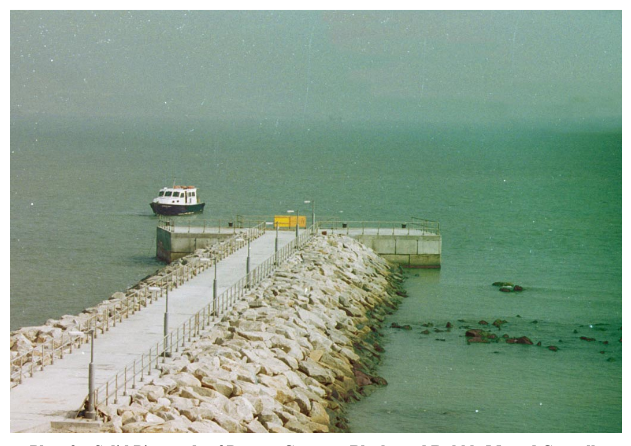
Plate 2 – Solid Pier made of Precast Concrete Blocks and Rubble Mound Catwalk