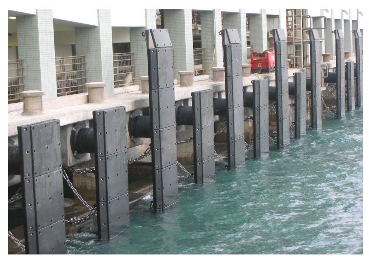
Plate 3 – Cell Fenders with Front Panel