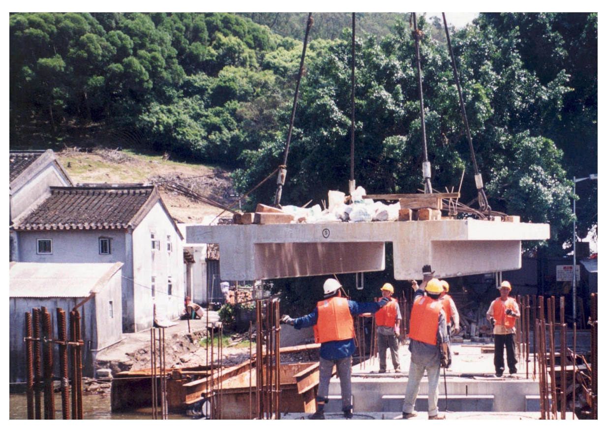
Plate 8 – Precast Concrete Beam and Slab