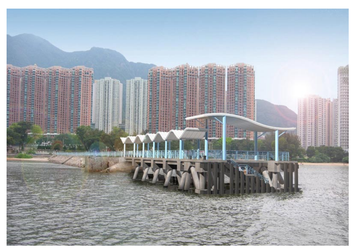
Plate 13 – Wu Kai Sha Public Pier