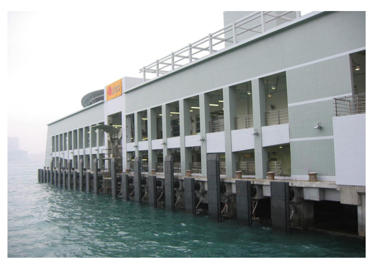
Plate 1 – Ferry Pier supported on Piles