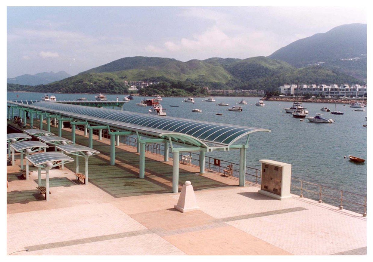
Plate 11 – Pak Sha Wan Public Pier