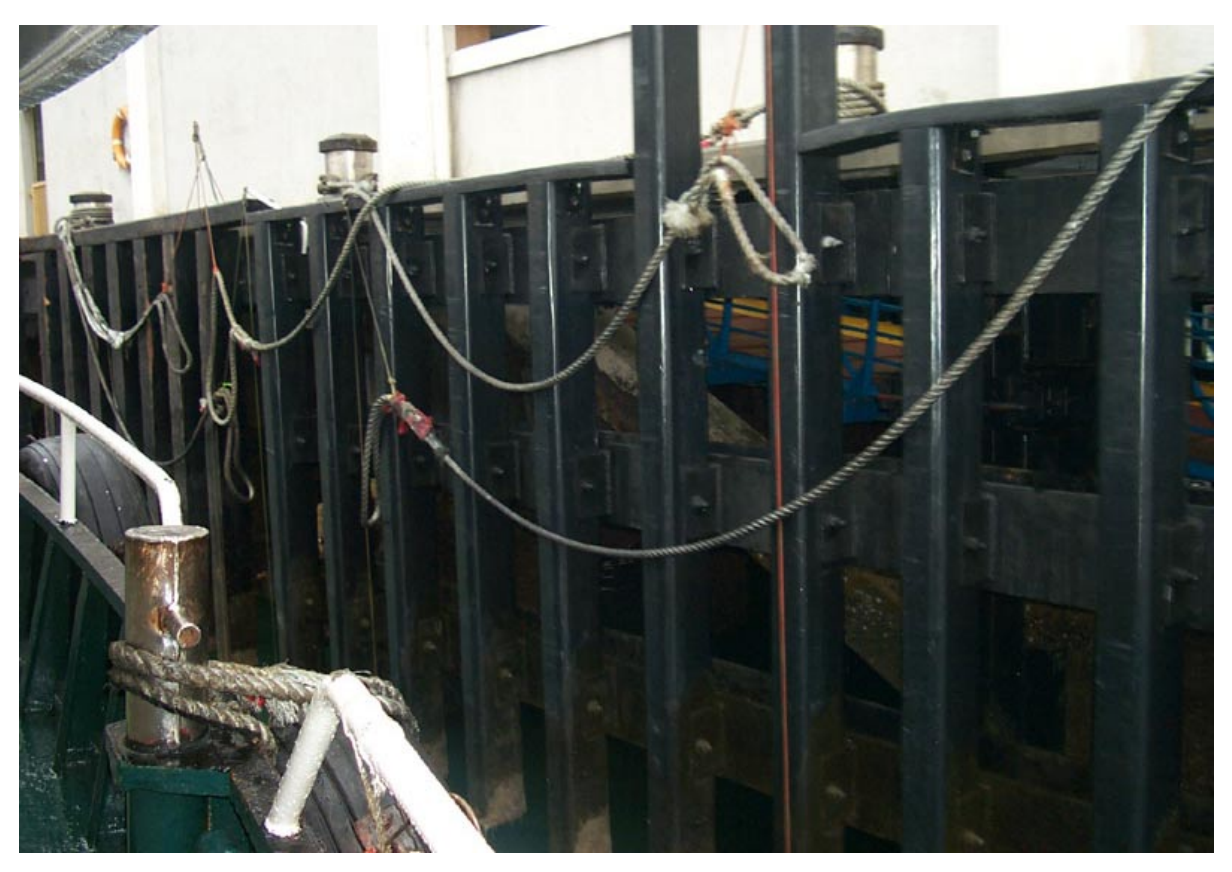
Plate 6 – Plastic Fenders