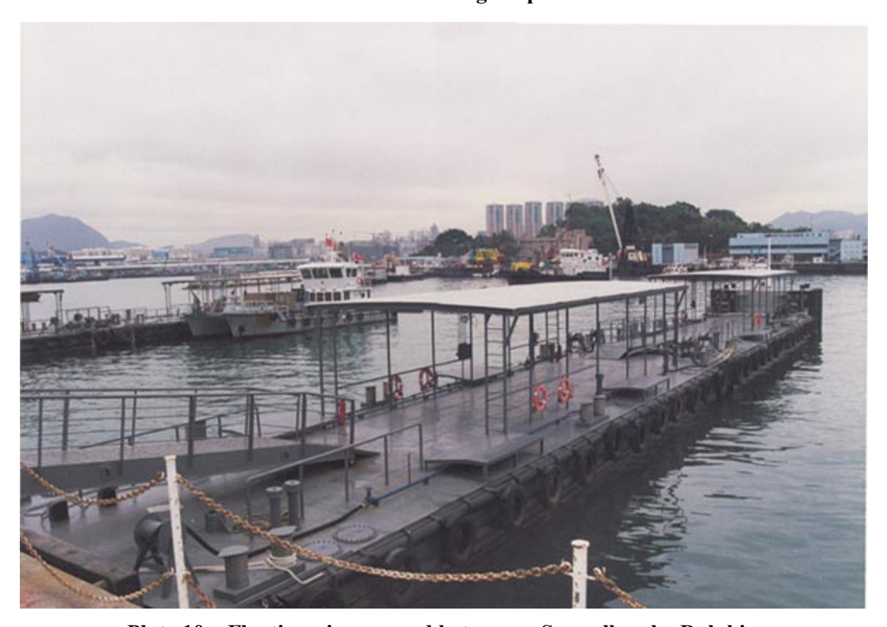
Plate 10 – Floating pier moored between a Seawall and a Dolphin