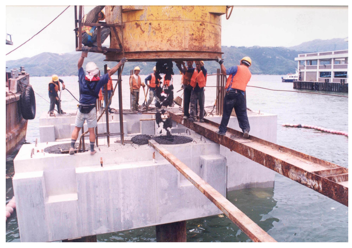
Plate 7 – Precast Concrete Pile Cap