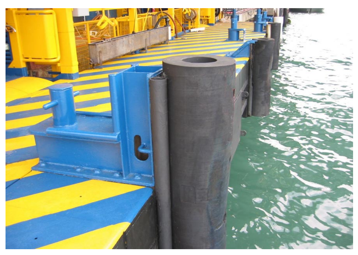
Plate 5 – Cylindrical Fenders