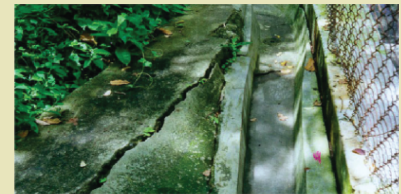
Figure 3 Widening of cracks