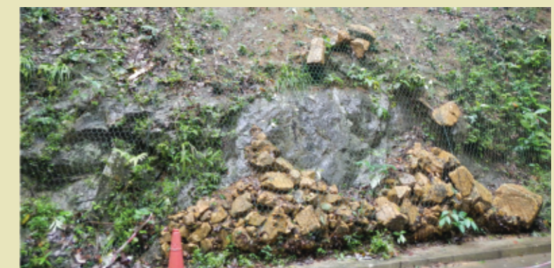
Figure 4 Rock debris retained by rock mesh