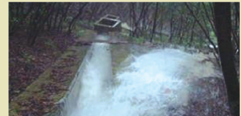
Figure 2 Spillage or overflow of drainage channels