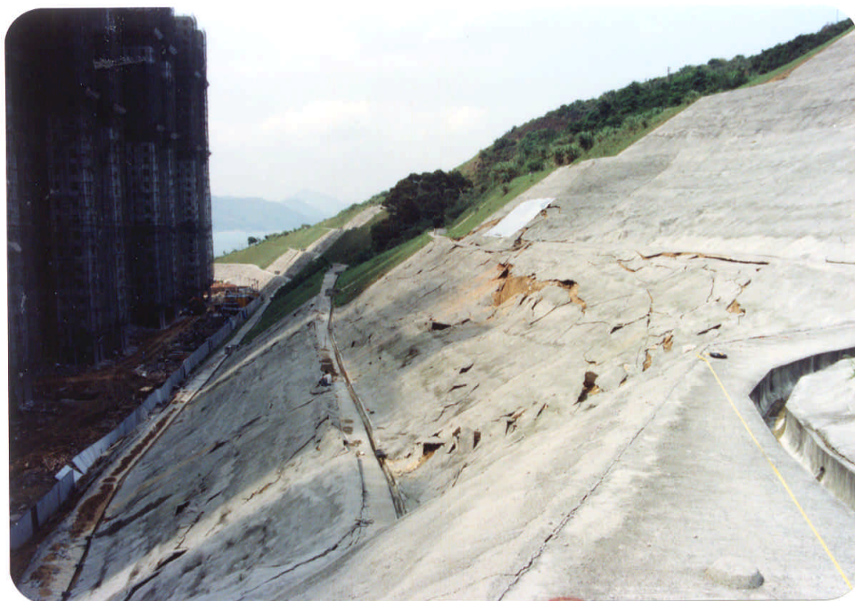
Plate 14 : Negative No. SP9203901 Taken on : 9-5-92

Description : Major failure of a soil and rock cut slope (about 100 m 3 ) affecting a construction site.