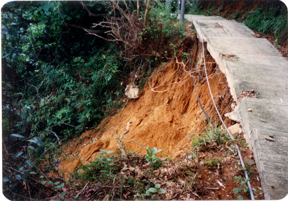
Plate 26 : Negative No. MW9210520 Taken on : 11-5-92