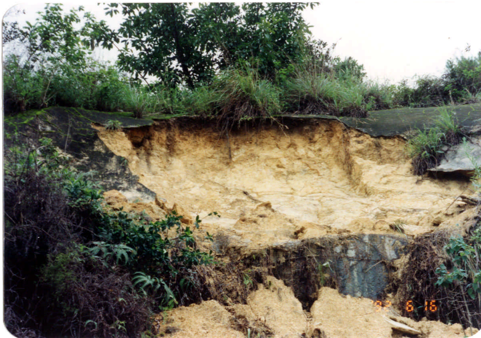
Plate 41 : Negative No. MW9214408 Taken on : 16-6-92

Description : Failure of a soil cut slope (about 5 m 3 ) leading to the partial blockage of a pedestrian pavement.