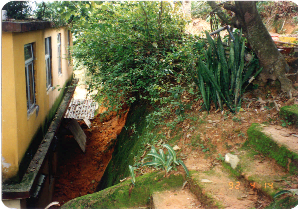
Plate 9 : Negative No. MW9208202 Taken on : 14-4-92

Description : Failure of a soil cut slope (about 10 m 3 ) resulting in the closure of a private pedestrian access behind a two-storey house.