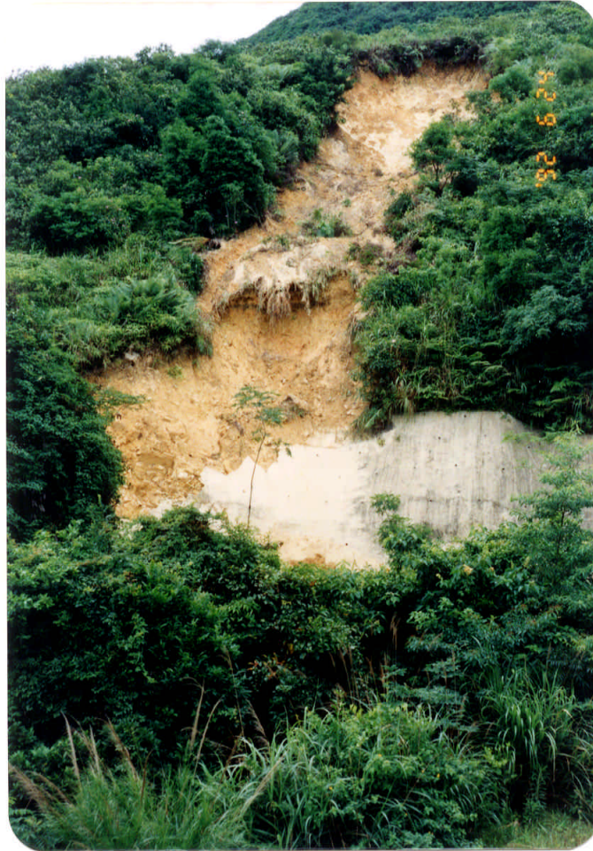
Plate 46 : Negative No. MW9216816 Taken on : 24-6-92

Description : Failure of a natural slope (about 15 m 3 ) resulting in the blockage of one lane of road.