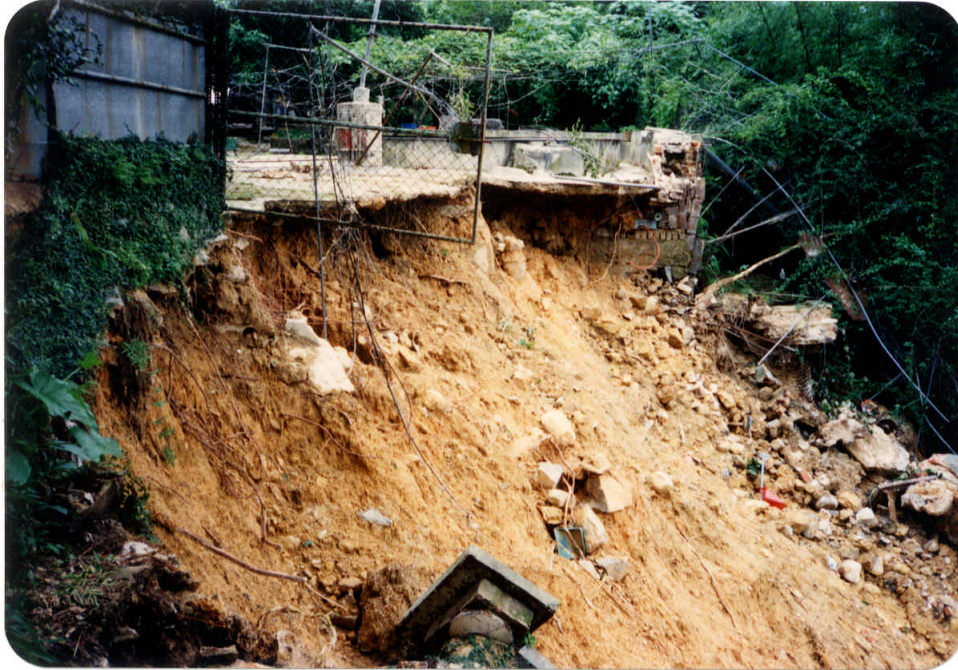
Plate 45 : Negative No. MW9216207 Taken on : 17-6-92

Description : Failure of a fill slope (about 40 m 3 ) resulting in the destruction of a private access and the evacuation of a private house.