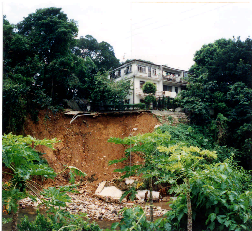
Plate 47 : Negative Nos. ME9230621 & ME9230622 Taken on : 21-7-92

Description : Failure of a natural slope (about 30 m 3 ), affecting the open area adjacent to a private house.