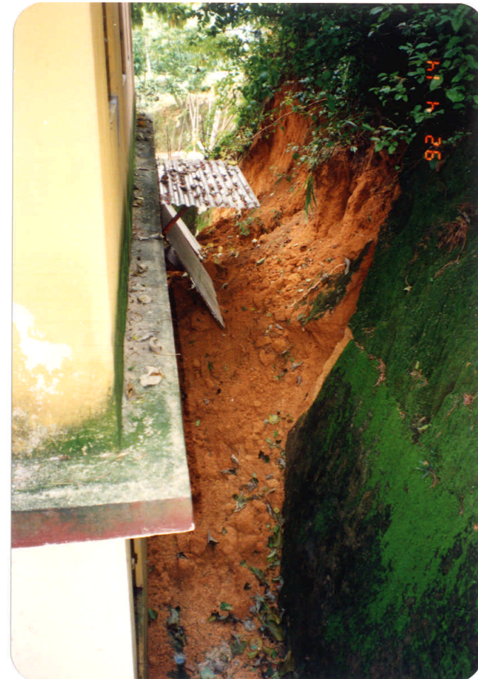
Plate 10 : Negative No. MW9208200 Taken on : 14-4-92

Description : Failure of a soil cut slope (about 10 m 3 ) resulting in the closure of a private pedestrian access behind a two-storey house.