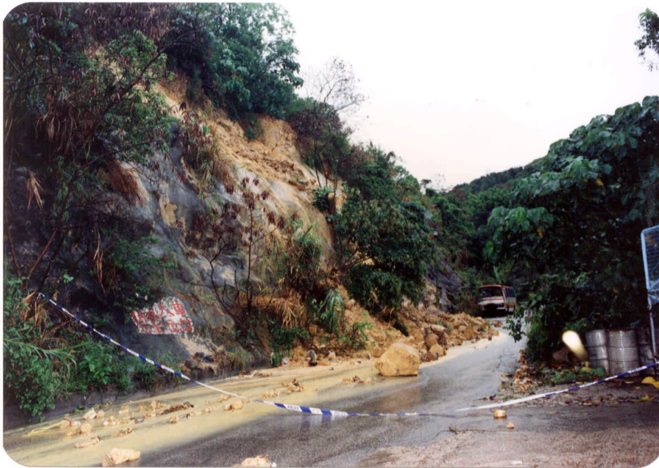
Plate 22 : Negative No. ME9217820 Taken on : 8-5-92 Description : Failure of a soil and rock cut slope (about 30 m 3 ) resulting in the partial blockage of an access road.

Plate 22 : Choi Shek Lane, Ngau Tau Kok, Slope No. 11NE-A/C104. (Incident K 5/1)