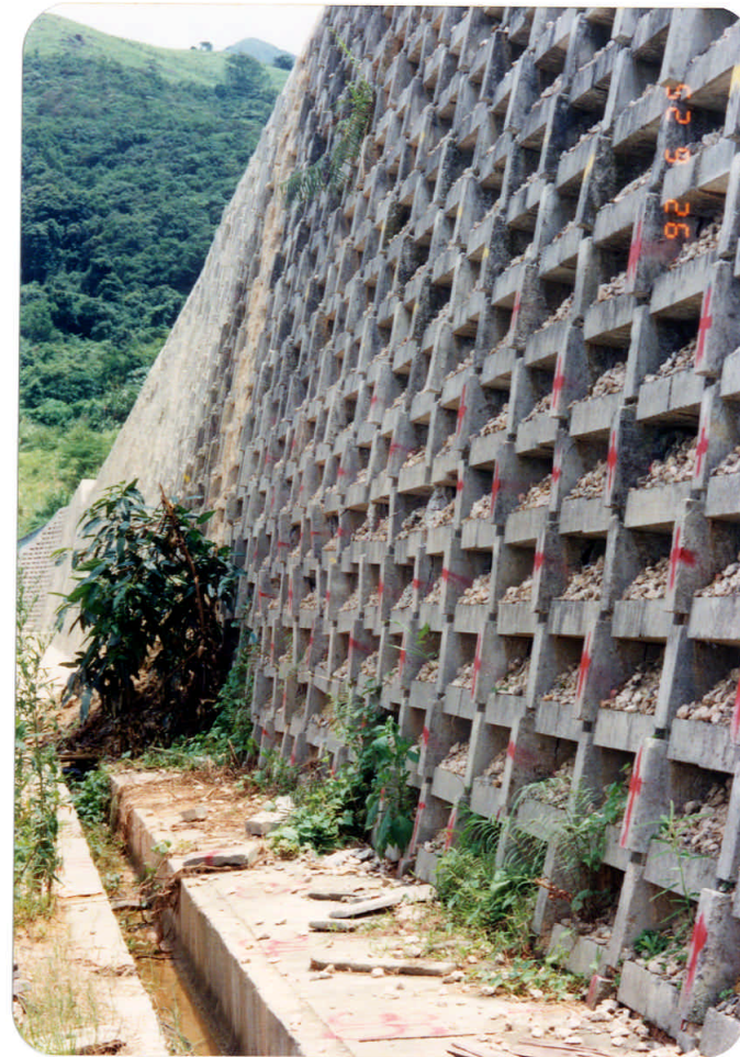
Plate 37 : Negative No. ME9226111 Taken on : 16-6-92

Description : Major failure of a soil cut slope (about 9000 m 3 ) resulting in the evacuation of private houses (due to severe cracking and subsidence) and excessive movements (bulging) of a crib wall.