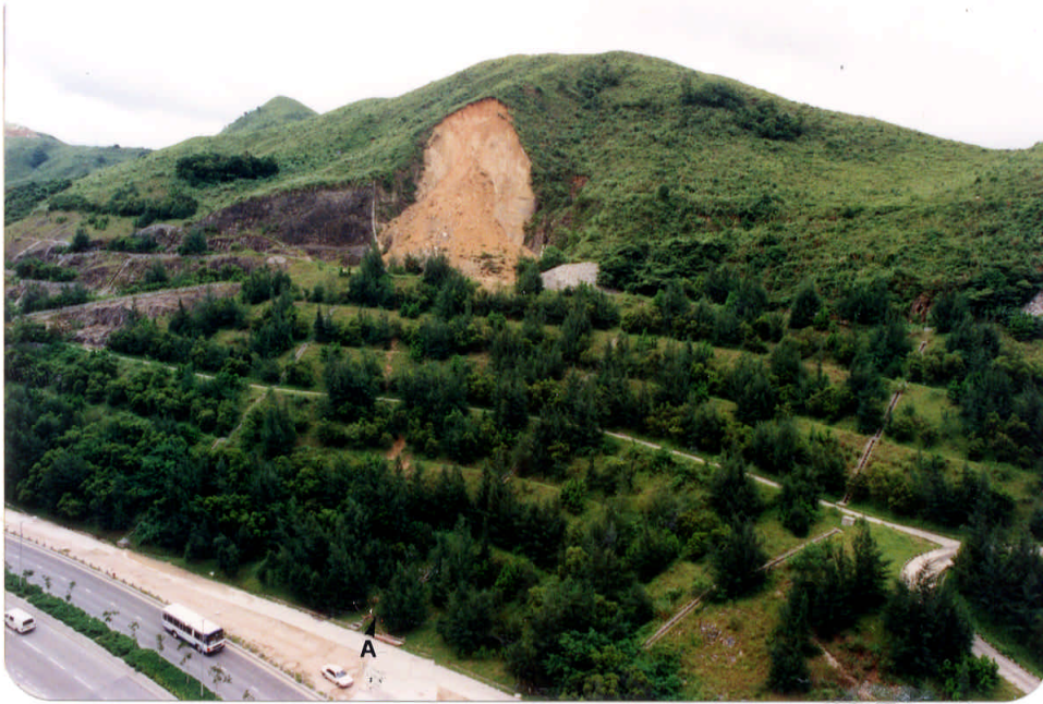
Plate 38 : Negative No. SP9222303 Taken on : 23-7-92

Description : Major failure of a soil/rock cut slope (about 300m 3 ) resulting in boulder falls and damage to an urban fringe park.