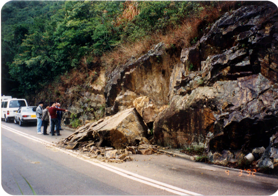
Plate 3 : Negative No. I9206505 Taken on : 4-3-92