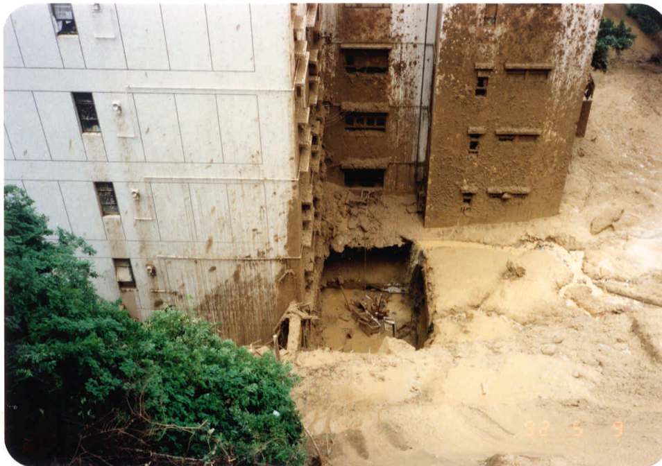
Plate 12 : Negative No. I92210I03 Taken on : 9-5-92 Description : Major failure of a retaining wall and fill platform (about 3500 m 3 ). Two dead, five injured, seven apartment blocks evacuated. Block 44 illustrated. Plates 11 & 12 : Baguio Villas, Victoria Road, Pokfulam. (Incident HK 5/8)