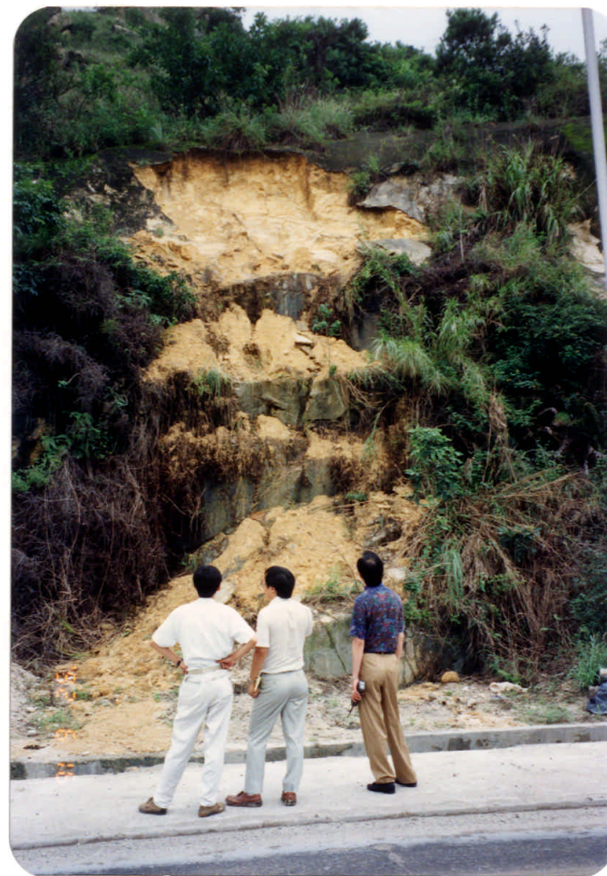
Plate 42 : Negative No. MW9214407 Taken on : 16-6-92

Description : Failure of a soil cut slope (about 5 m 3 ) leading to the partial blockage of a pedestrian pavement.