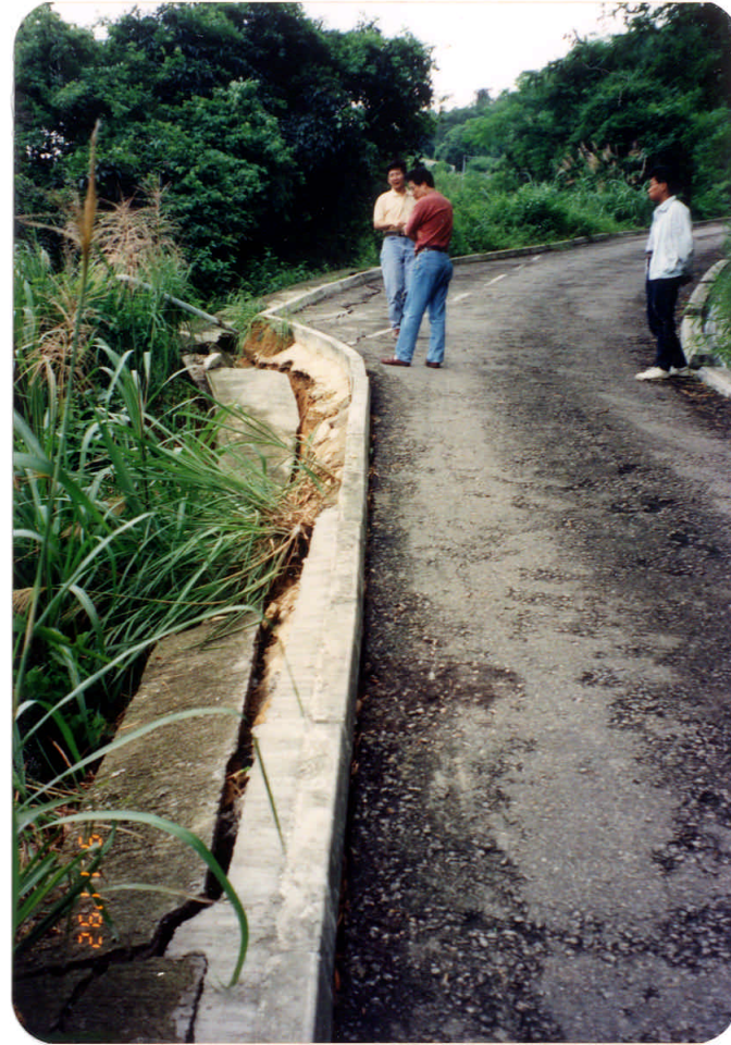
Plate 25 : Negative No. ME9218018 Taken on : 11-5-92

Description : Subsidence of a pedestrian pavement resulting in closure of pavement