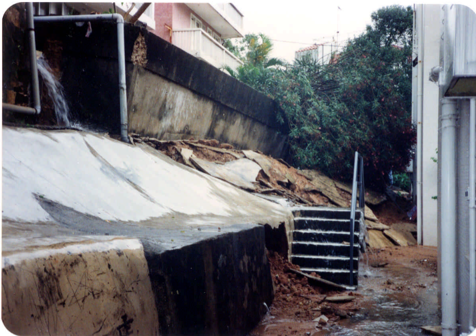
Plate 30 : Negative No. MW9209807 Taken on : 8-5-92

Description : Failure of a retaining wall (about 45m 3 ) leading to closure of a private pedestrian access and the evacuation of an apartment.