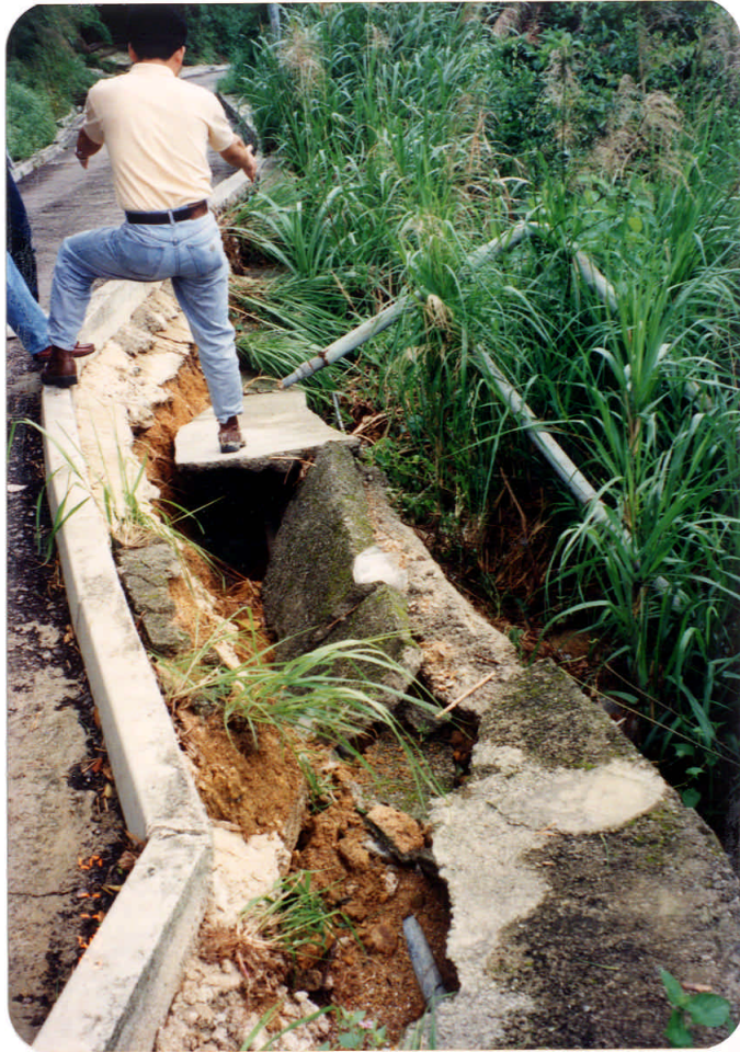
Plate 24 : Negative No. ME9218019 Taken on : 11-5-92