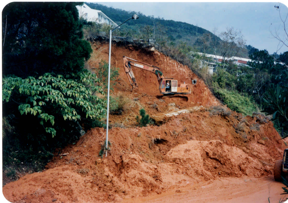
Plate 2 : Negative No. MW9200814A Taken on : 21-1-92

Description : Major failure (about 1000m 3 ) of a soil cut slope resulting in the blockage of two lanes of road.