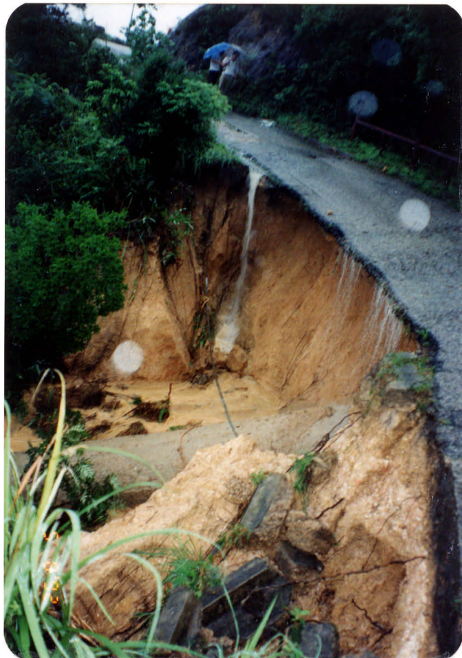
Plate 23 : Jat's Incline above Fung Shing Street. (Incident K 5/6)

Description : Major failure of a fill slope (about 65 m 3 ) resulting in road closure.