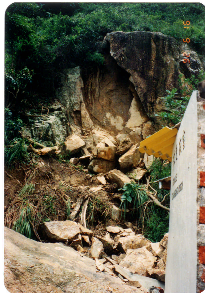
Plate 44 : Negative No. MW9214915 Taken on : 16-6-92

Description : Failure of a rock cut slope ( about 10 m 3 ) damaging several changing rooms at a beach resort.