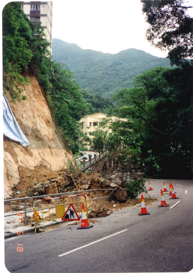
Plate 15 : Negative No. I9226113 Taken on : 18-5-92

Description : Failure of a soil cut slope (5-10 m 3 ) resulting in the blockage of a pedestrian pavement and partial blockage of one lane of road.