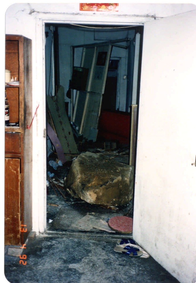
Negative No. I9214317 Taken on : 13-4-92 Description : Boulder fall from a rock cut slope resulting in the evacuation of a squatter hut.

Plate 7 : Yee King Road, opposite Islamic College and near Lamp Post 33389, Slope No. 11SE-A/C214. (Incident HK 4/21)