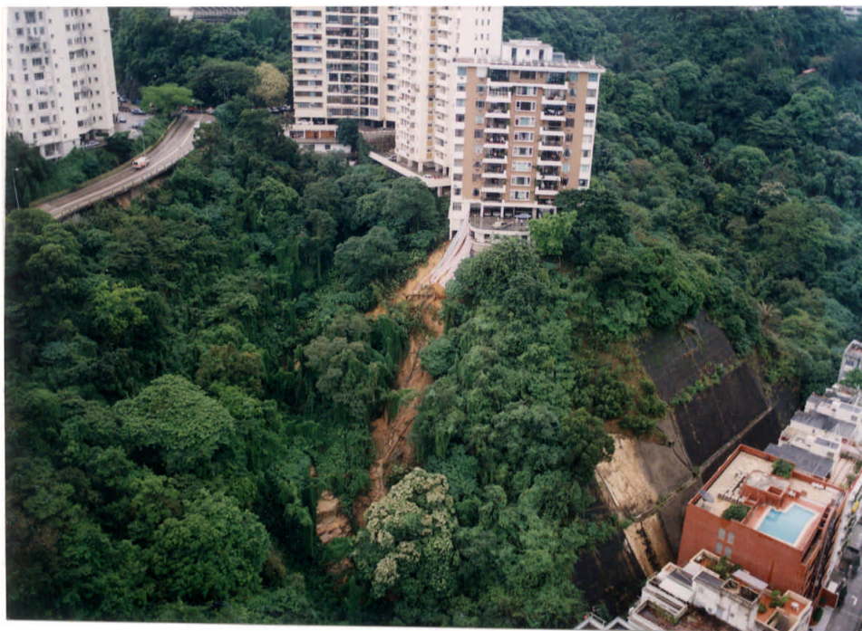
Plate 20 : Negative No. PS71003 Taken on : 9-5-92

Description : Major failure of a fill slope (about 100 m 3 ), resulting in the exposure of a foundation column of an apartment block.