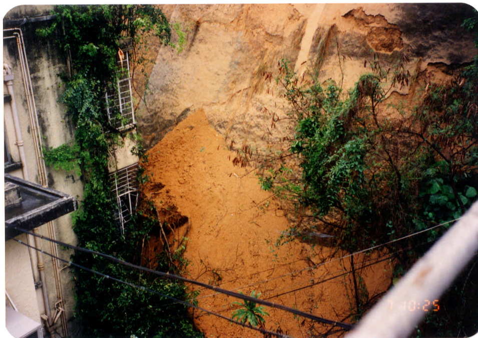
Plate 6 : Negative No. I9212107 Taken on : 7-4-92

Plates 5 & 6 : Nos. 33 to 37 Blue Pool Road, Slope No. 11SW-D/CR178. (Incident HK 4/2)