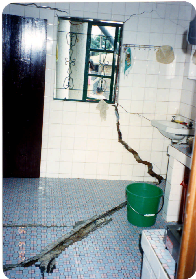
Plate 36 : Negative No. ME9224705 Taken on : 16-6-92