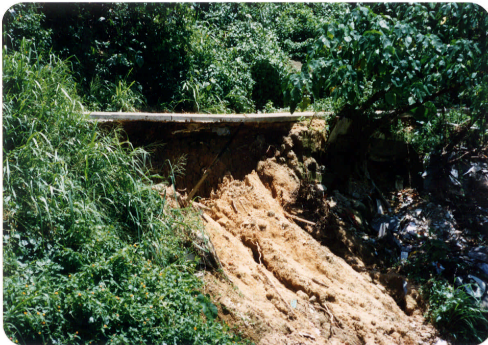
Plate 49 : Negative No. MW9219417 Taken on : 28-7-92

Description : Failure of a soil cut slope (about 25 m 3 ) resulting in the closure of a pedestrian footpath.