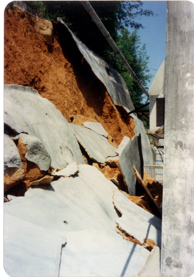
Plate 32 : Negative No. MW9211206 Taken on : 13-5-92

Description : Failure of a soil cut slope (about 20 m 3 ) resulting in the evacuation of a private house.