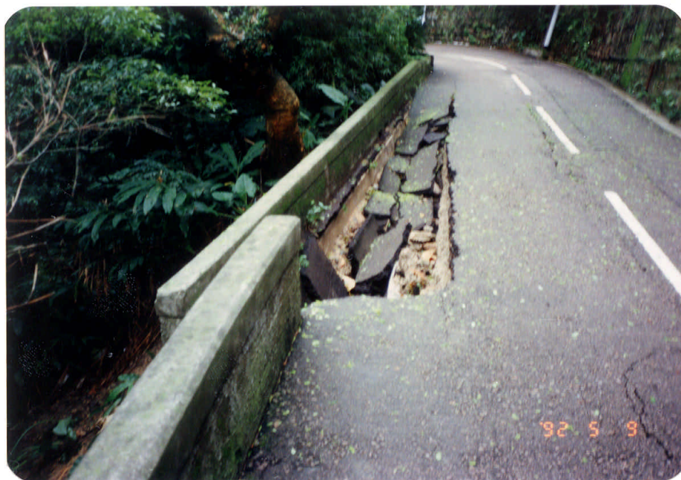
Plate 21 : Negative No. A9206704 Taken on : 9-5-92

Plate 20 : Below No.156 Tai Hang Road, So Kon Po. (Incident HK 5/50)