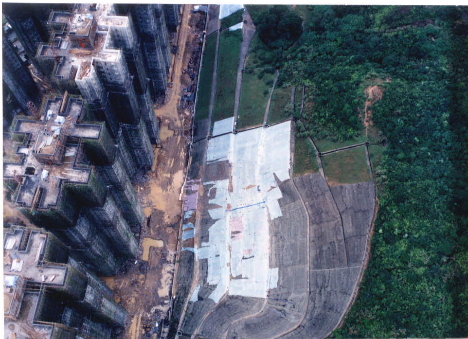
Plate 13 : Negative No. PS70911 Taken on : 9-5-92