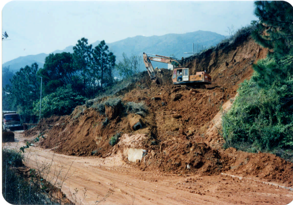
Plate 1 : Negative No. MW9200819 Taken on : 21-1-92