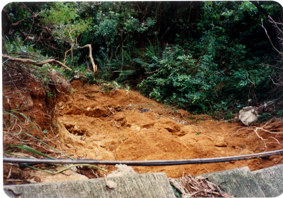
Plate 27 : Negative No. MW9210522 Taken on : 11-5-92

Description : Major failure of a natural slope (about 200 m 3 ) resulting in the closure of a footpath.