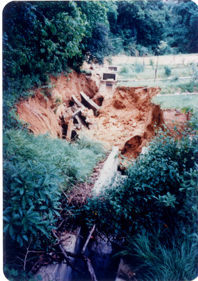
Plate 28 : Negative No. SP9300104 Taken on : 9-5-92

Description : Major failure of a fill slope ( >50 \text{ m}^3 ) resulting in the closure of one lane of road.