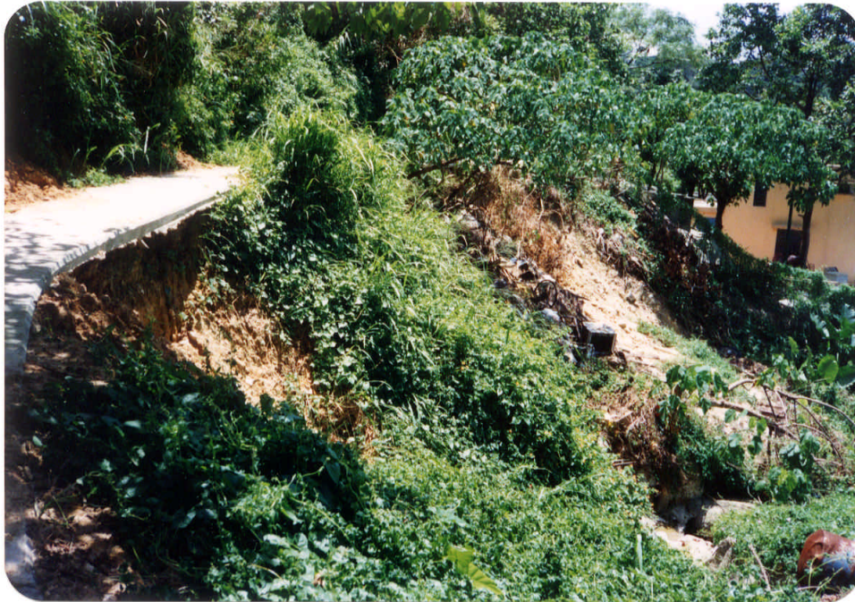
Plate 48 : Negative No. MW9219405 Taken on : 28-7-92