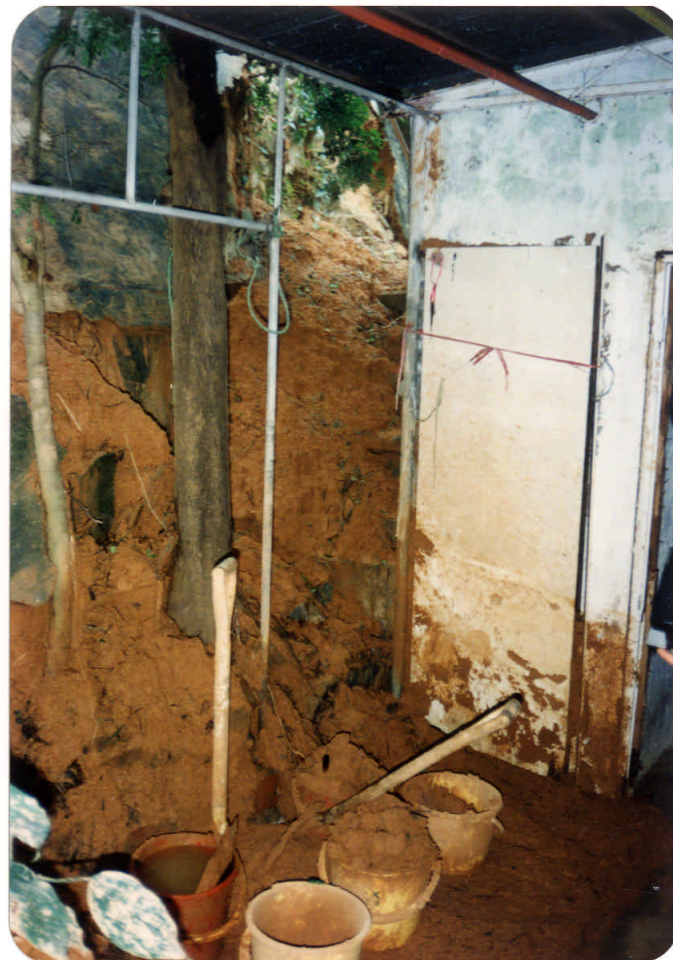
Plate 34 : Negative No. MW9213101 Taken on : 16-6-92

Description : Failure of a soil cut slope (about 4 m 3 ) resulting in the closure of a private back lane and the evacuation of two squatter huts.