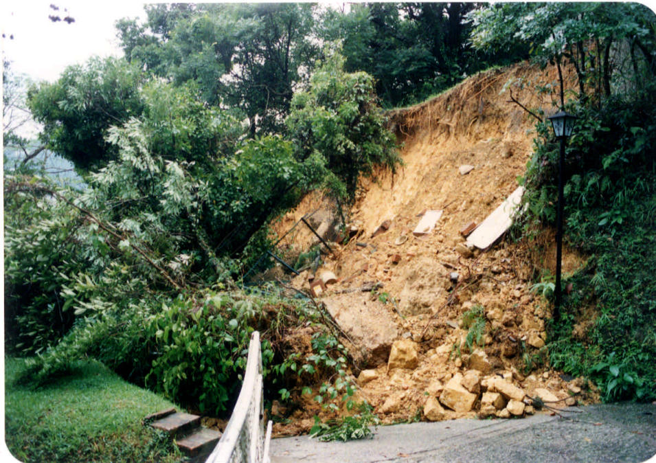
Plate 19 : Negative No. I9220814 Taken on : 9-5-92

Description : Failure of a soil cut slope (about 45 m 3 ) resulting in the blockage of a private access.