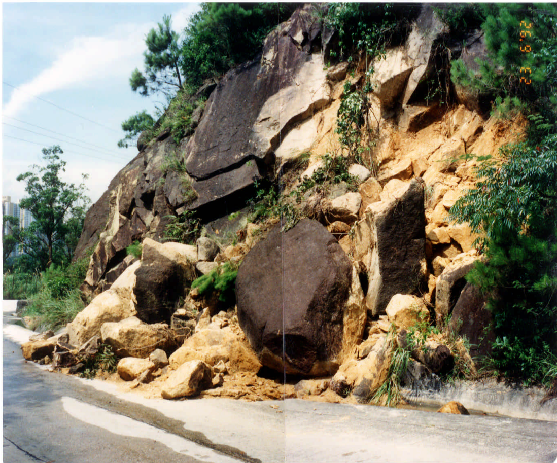
Plate 40 : Negative Nos. ME9225818 & ME9225819 Taken on : 23-6-92

Description : Failure of a rock cut slope (about 30 m 3 ) resulting in the partial blockage of a rural road.