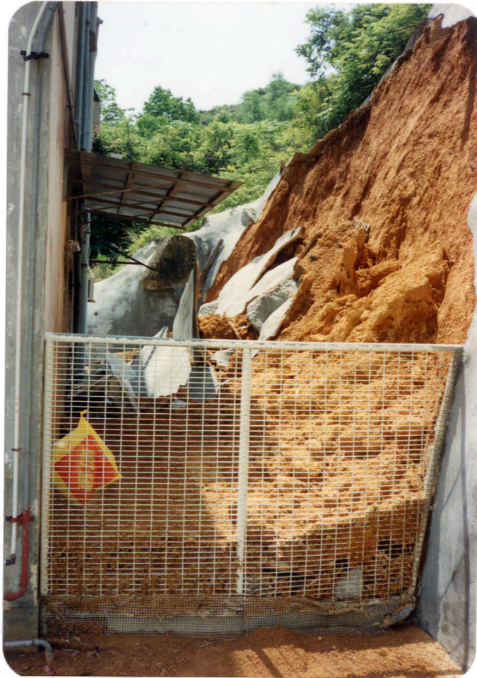
Plate 31 : Negative No. MW 9211204 Taken on: 13-5-92