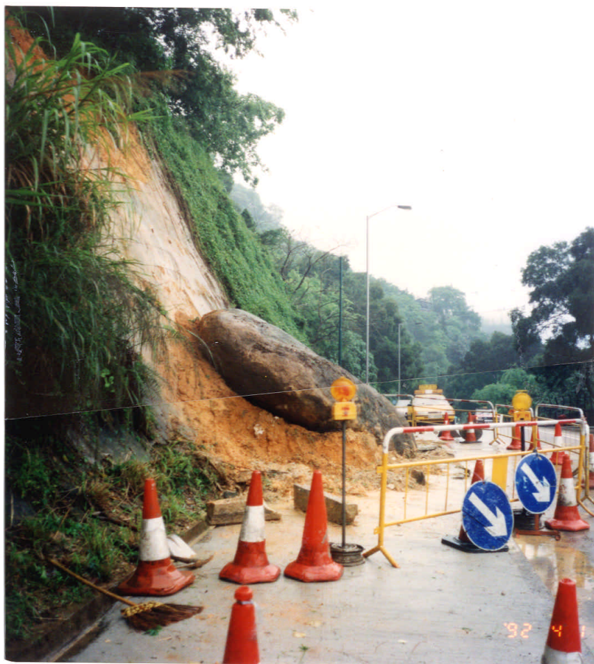
Negative Nos. I9213709A & I9213710A Taken on : 11-4-92 Description : Boulder fall (about 20 m 3 ) resulting in the blockage of 1 lane of road.

Plate 7 : Yee King Road, opposite Islamic College and near Lamp Post 33389, Slope No. 11SE-A/C214. (Incident HK 4/21)