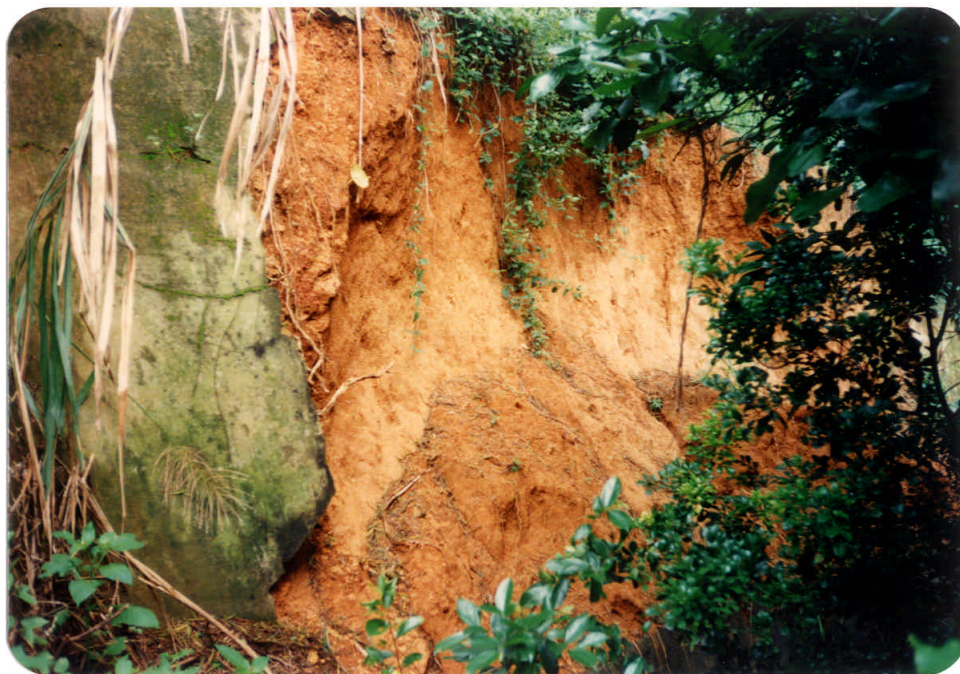
Plate 33 : Negative No. MW9213100 Taken on : 20-5-92

Description : Failure of a soil cut slope (about 4 m 3 ) resulting in the closure of a private back lane and the evacuation of two squatter huts.