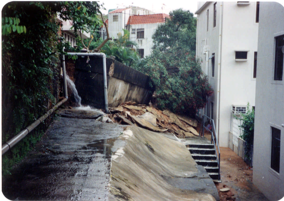
Plate 29 : Negative No. MW9209806 Taken on : 8-5-92