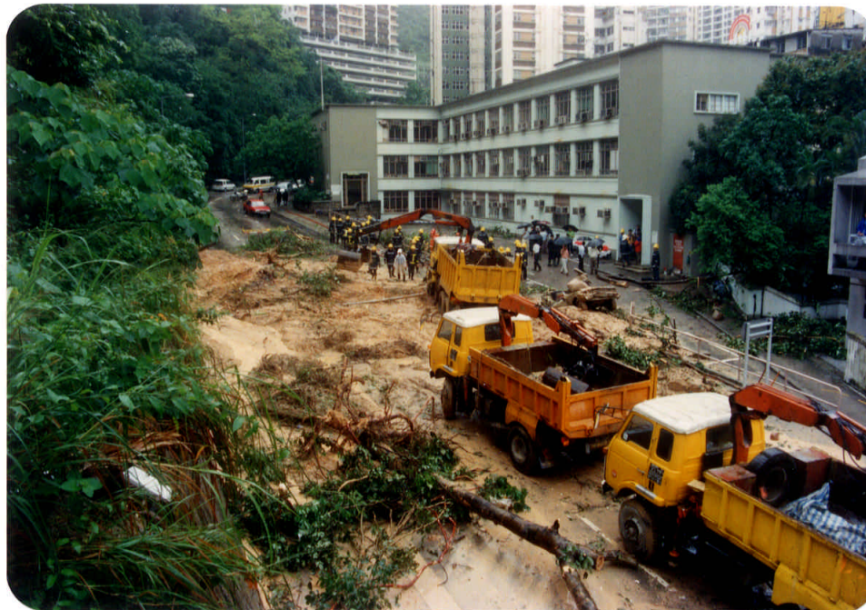
Plate 17 : Negative No. SP9206021 Taken on : 8-5-92 Description : Major failure of a fill slope (about 500 m 3 ). One dead, three lanes of Kennedy Road blocked.

Plates 16 & 17 : Kennedy Road, below Wah Yan College, Happy Valley, Fill Slope above Slope No. 11SW-D/CR403. (Incident HK 5/38)