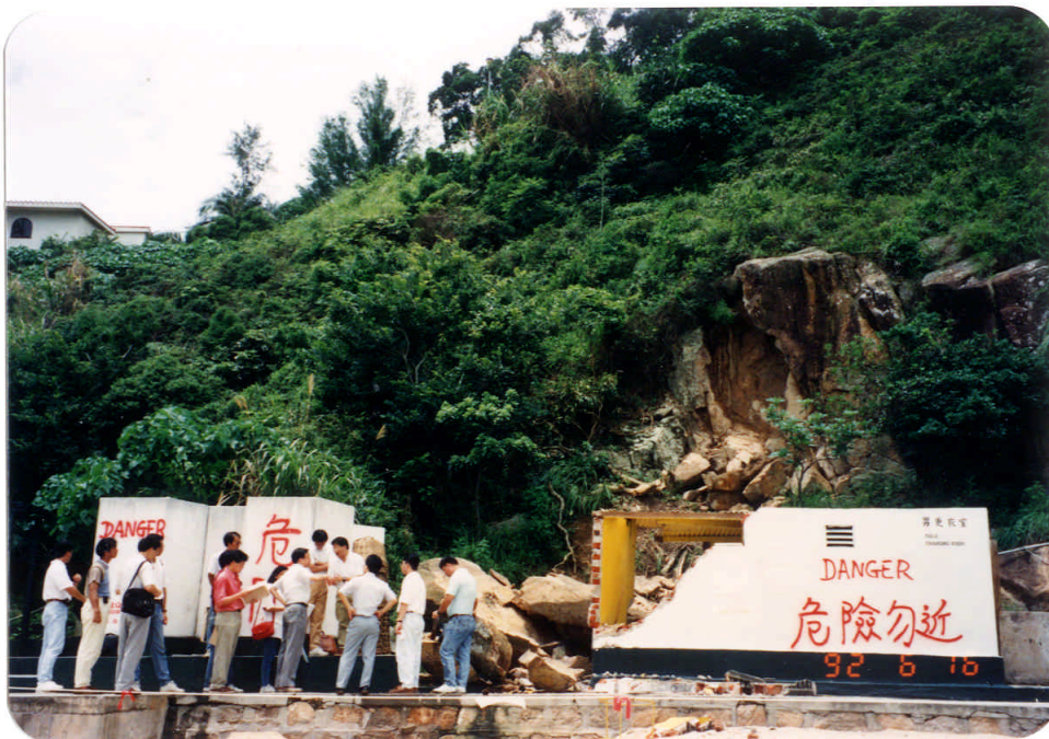
Plate 43 : Negative No. MW9214920 Taken on : 16-6-92

Description : Failure of a rock cut slope ( about 10 m 3 ) damaging several changing rooms at a beach resort.