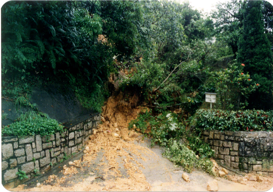
Plate 18 : Negative No. I9220812 Taken on : 9-5-92