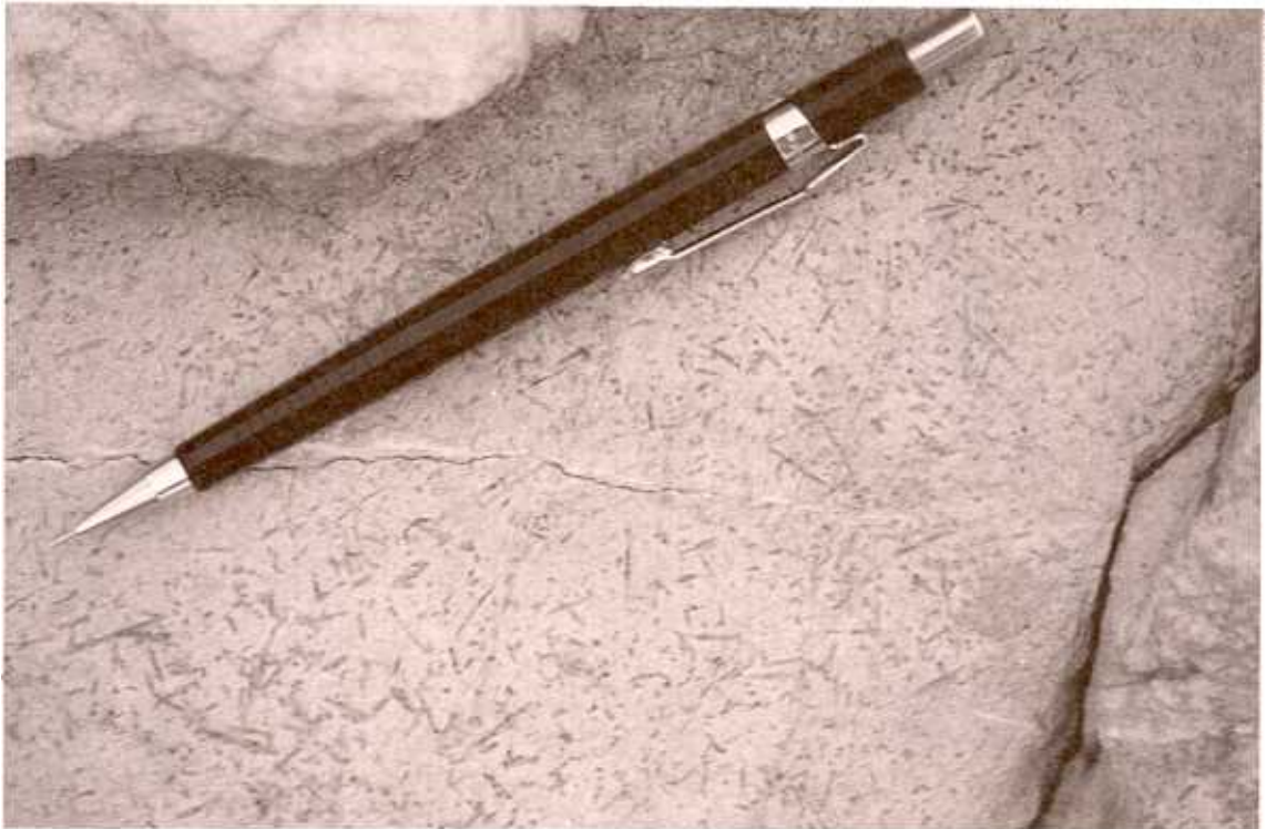
Plate 1 - Andalusite Crystals in Sandstone of the Lok Ma Chau Formation Exposed on Tsz Kan Chau (15880 20849)

At the southeastern end of Tsz Kan Chau, the sedimentary rocks are composed of cream to brown, cross-bedded, pebbly coarse-grained sandstone to laminated fine-grained quartz sandstone, with sparse,