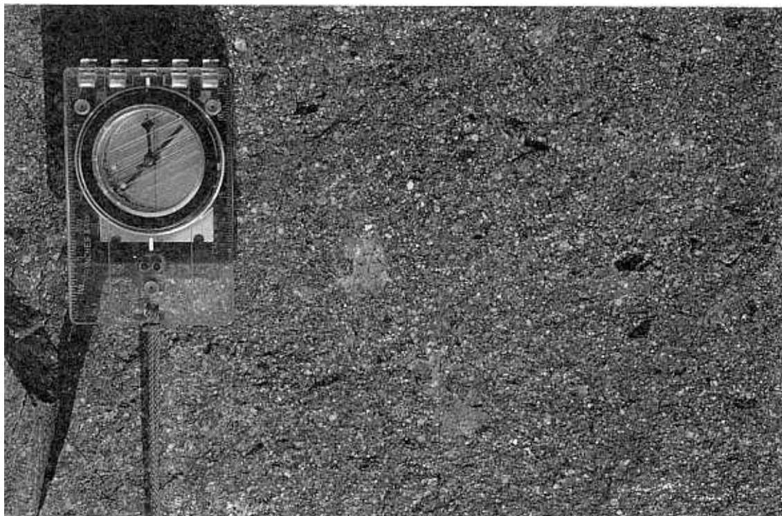
Plate 2 - Massive Coarse-ash Crystal Tuff of the Yim Tin Tsai Formation Exposed on Tang Lung Chau (24590 22340)

Lapilli-bearing coarse-ash crystal tuff of the Yim Tin Tsai Formation is chiefly exposed in the northern part of the district on Ma Wan and the Tsing Chau Tsai peninsula (Plate 2). The formation is generally rhyodacitic in composition and is typically massive in outcrop although may occasionally exhibit flow foliation. Very rare intercalated fine-ash tuff horizons are found on the northern tip of Ma Wan and these are considered to be close to the top of the succession. Flow-banded lava clasts, up to 150 mm in diameter, commonly have sharp edges. Petrographically, the Yim Tin Tsai tuff has relatively equal proportions of quartz and alkali feldspar but plagioclase content may vary. The chief mafic minerals are biotite and amphibole, and accessory minerals comprise zircon, apatite, monazite, and magnetite. In a typical thin section from north Lantau Island, the proportions of these minerals are quartz 35%, alkali feldspar 25%, plagioclase 30%, biotite 7%, amphibole 3%, and trace accessory minerals (Plate 3). Total crystal content (>0.06 mm) varies from 40 to 60%. The overall thickness of the Yim Tin Tsai Formation succession in the district is estimated to be 500 m.