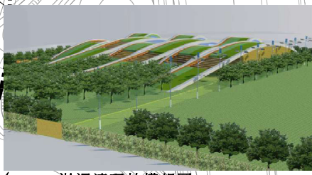
淤泥清理站構想圖 ARTIST'S IMPRESSION OF DESILTING COMPOUND

圖則名稱 drawing title 啟德明渠重建及改善工程-平面圖 RECONSTRUCTION AND UPGRADING OF KAI TAK NULLAH -LAYOUT PLAN